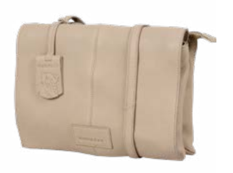
Black, grey and cognac are available as NOOS items