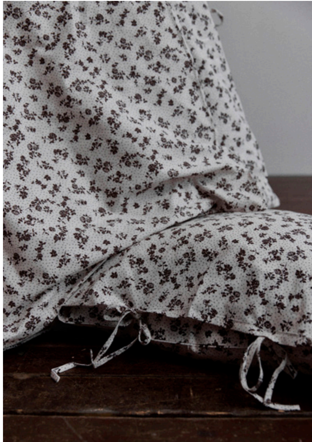
Hazel Rose Bedlinen Set – H24AW0037