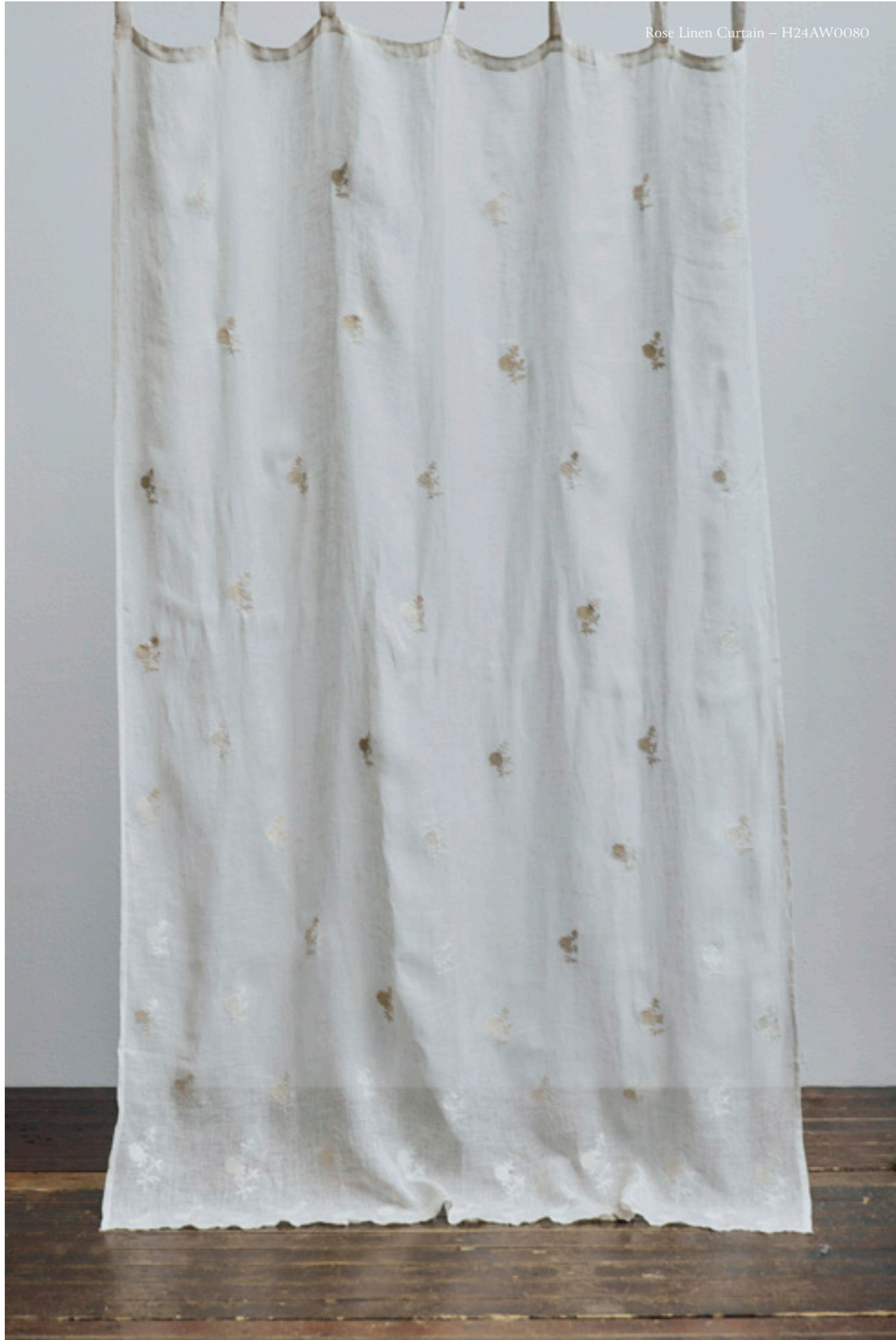
Rose Linen Curtain - H24AW0080