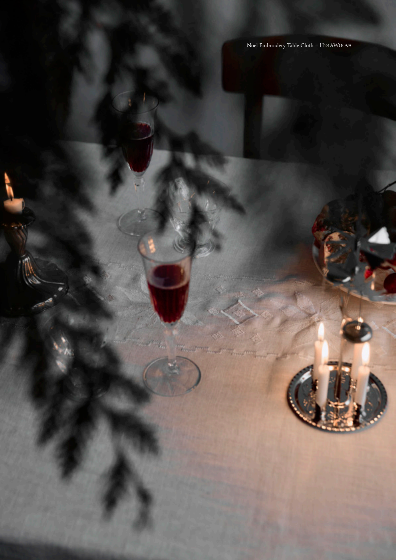
Noel Embroidery Table Cloth – H24AW0098