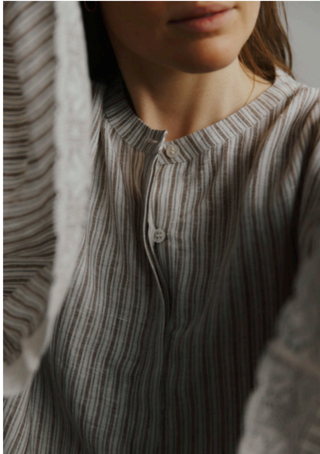
Mynte 7/8 Shirt – C24AW0022