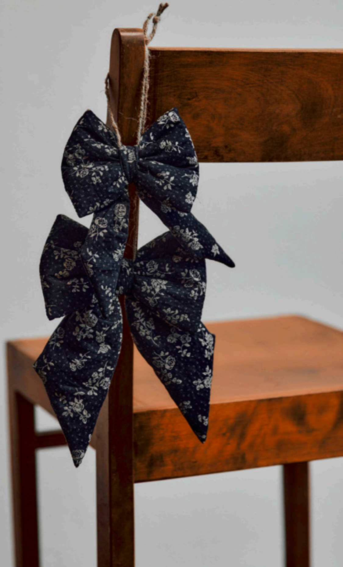
Kamille Bow – H24AW0054