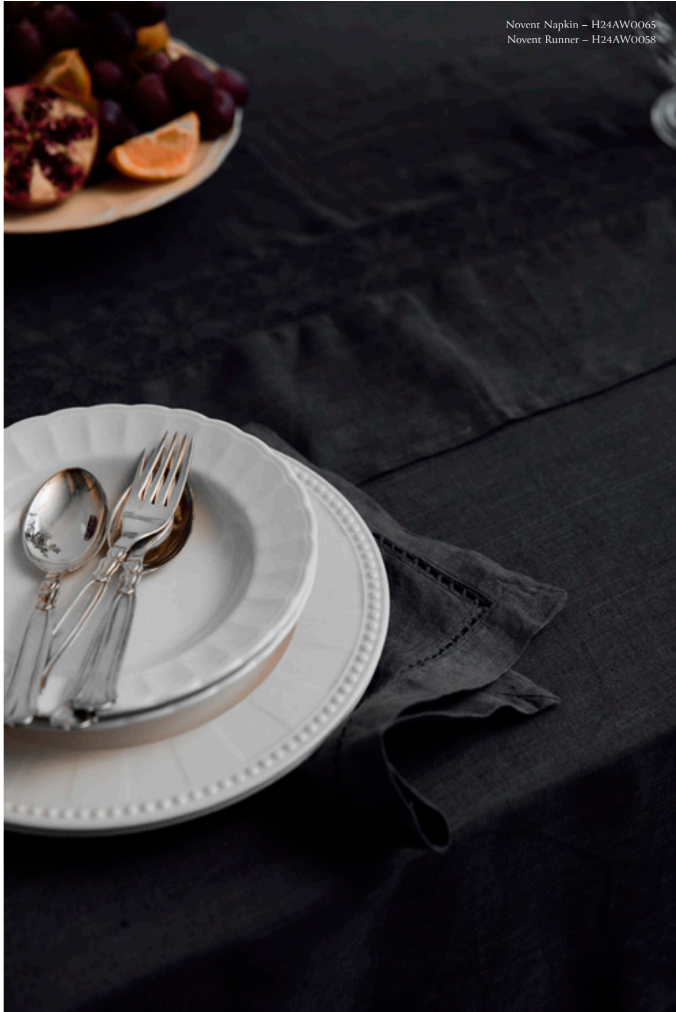
Novent Napkin - H24AW0065 Novent Runner - H24AW0058