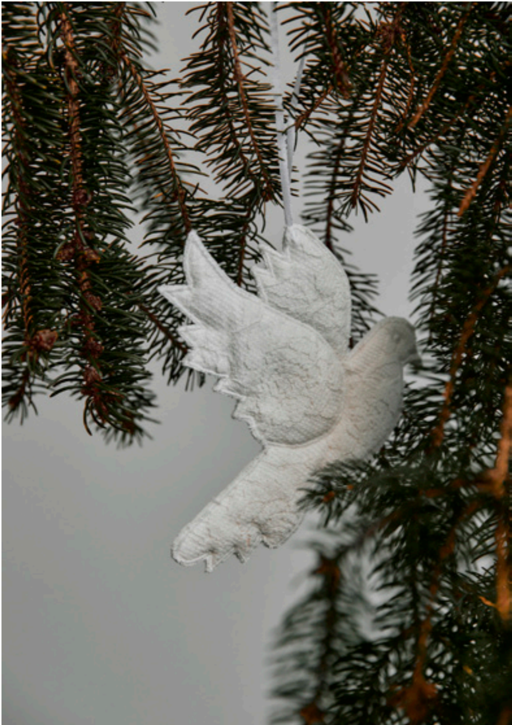
Christmas Lace Dove – H24AW0093