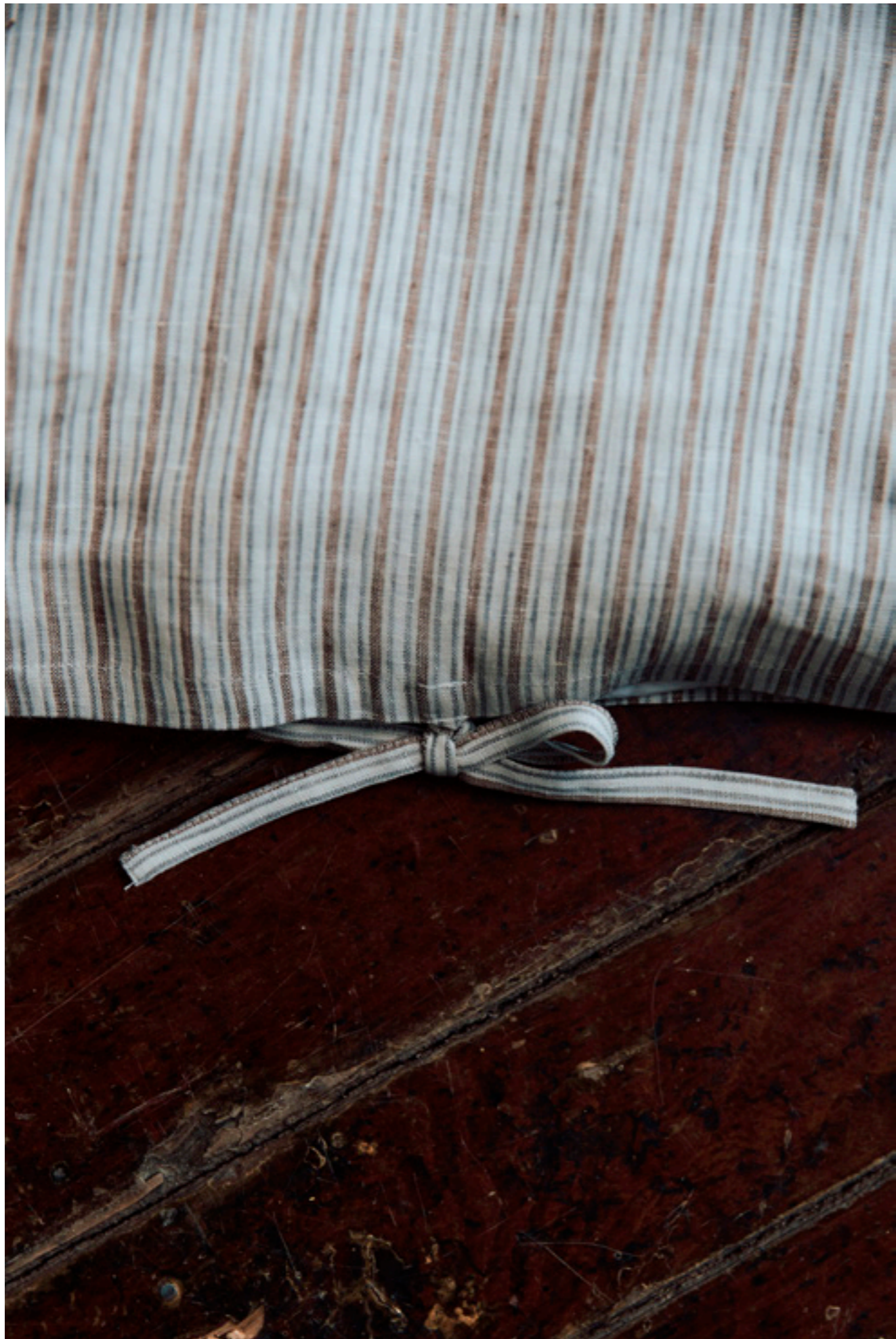
Mynte Bedlinen Set – H24AW0108