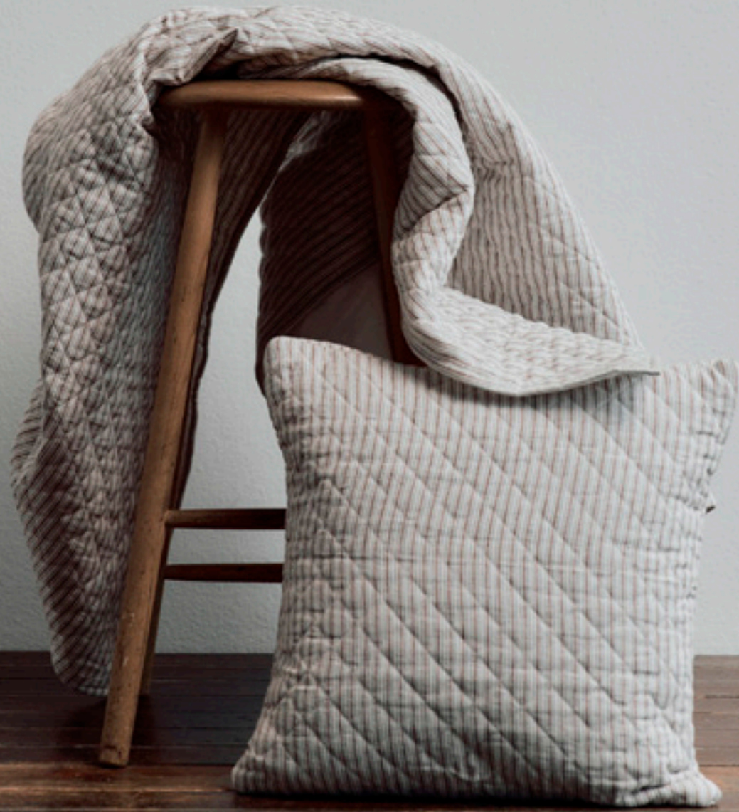
Mynte Quilt Plaid – H24AW0109 Mynte Quilt Cushion – H24AW0110