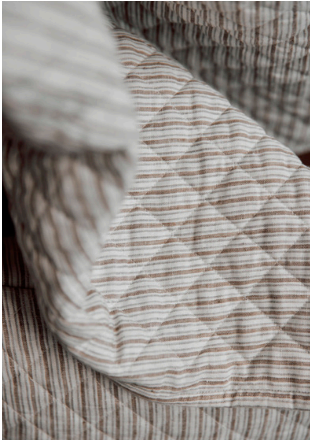
Mynte Quilt Plaid - H24AW0109