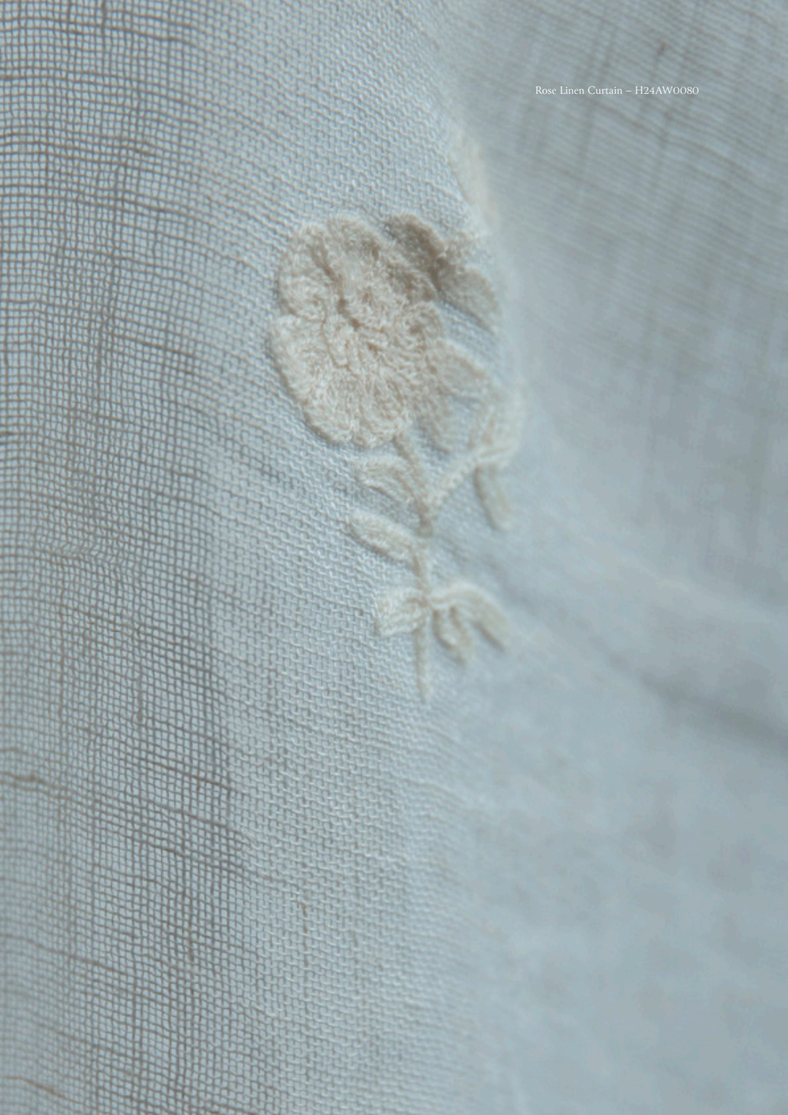
Rose Linen Curtain - H24AW0080