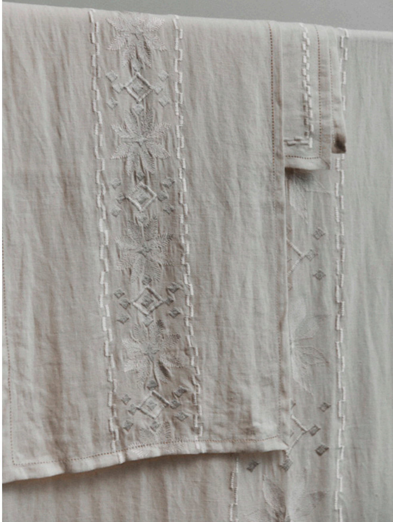
Noel Embroidery Runner – H24AW0101 Noel Embroidery Table Cloth – H24AW0098 Noel Embroidery Napkin – H24AW0094