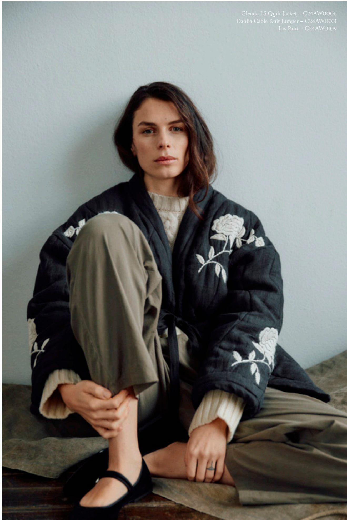
Glenda LS Quilt Jacket - C24AW0006 Dahlia Cable Knit Jumper - C24AW0031 Iris Pant - C24AW0109