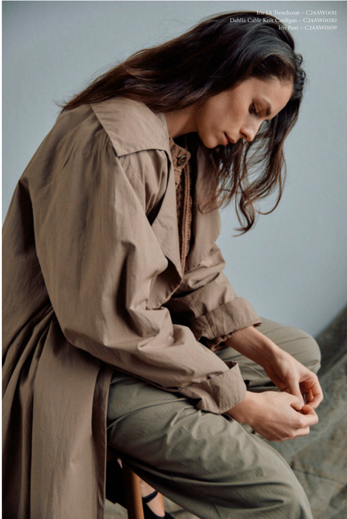
Iris LS Trenchcoat – C24AW0011 Dahlia Cable Knit Cardigan – C24AW0030 Iris Pant – C24AW0109