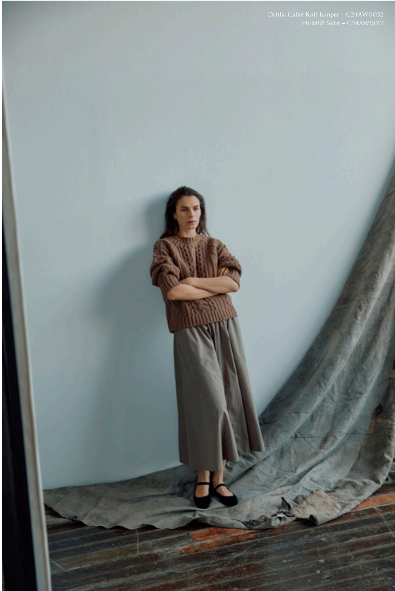
Dahlia Cable Knit Jumper – C24AW0032 Iris Midi Skirt – C24AW0012