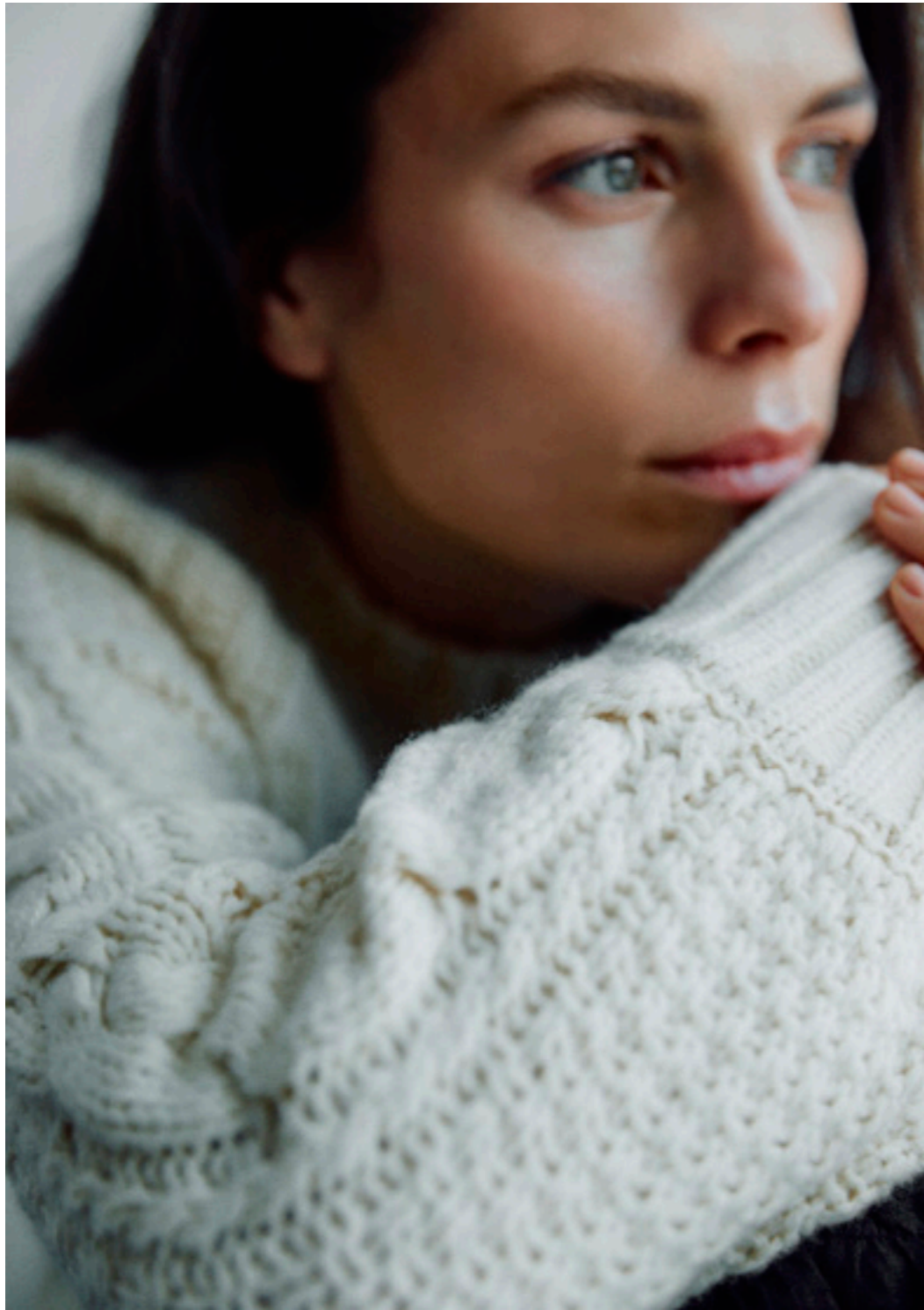
Dahlia Cable Knit Cardigan – C24AW0029