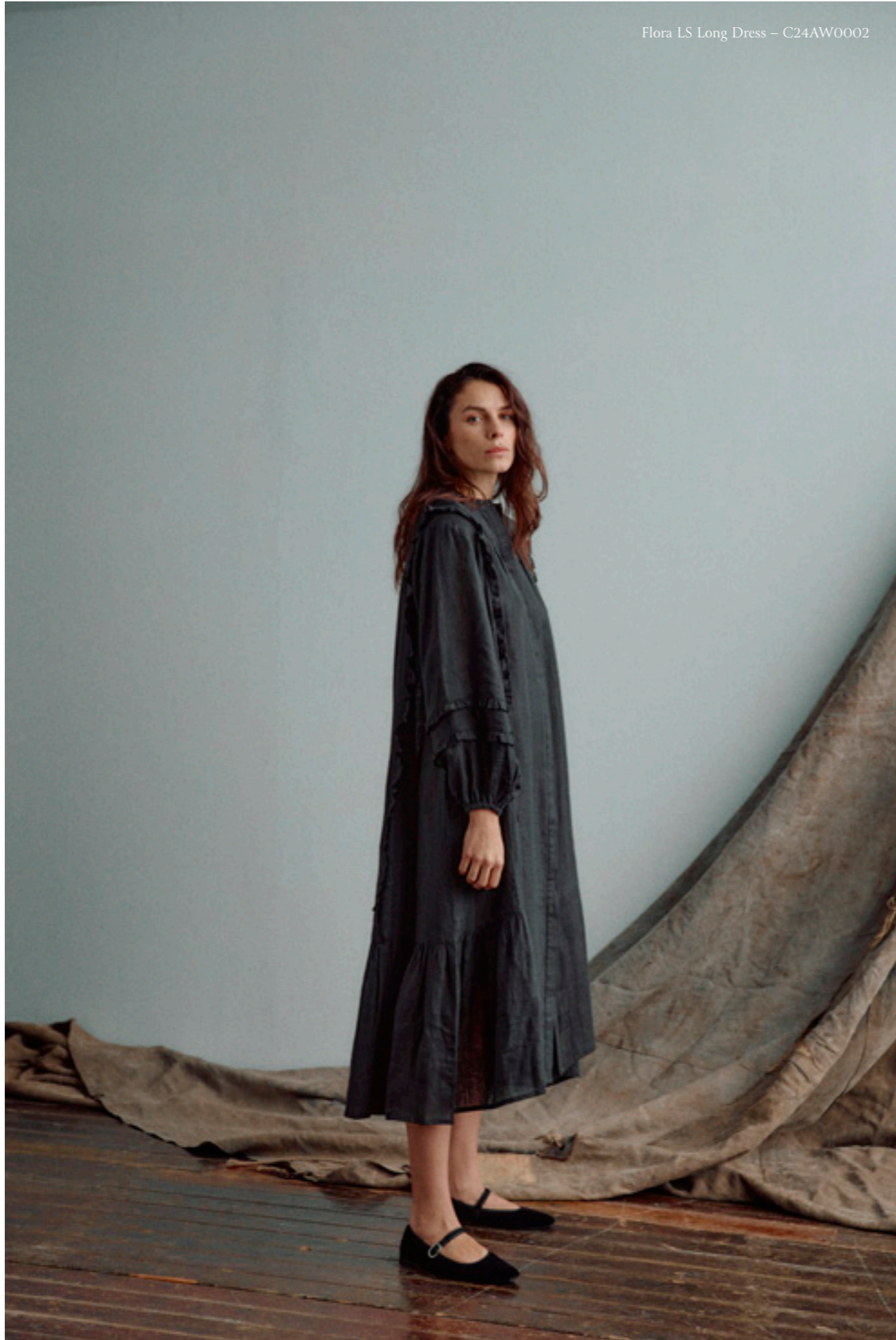
Flora LS Long Dress – C24AW0002