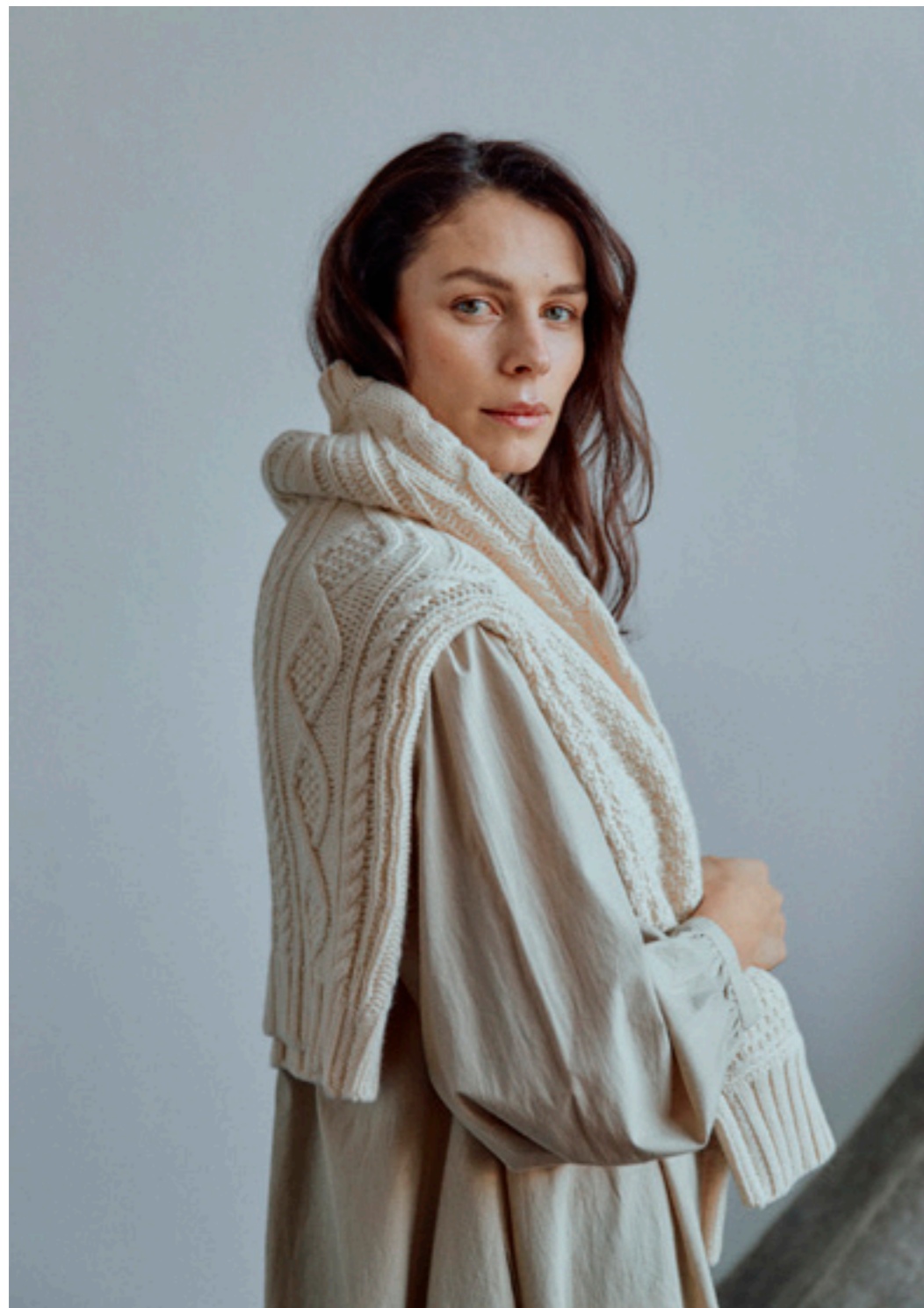
Dahlia Cable Knit Jumper – C24AW0031 Bella LS Shirt Dress – C24AW0001