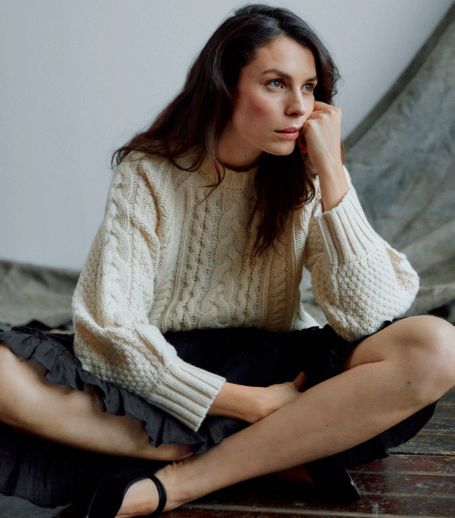
Flora Maxi Skirt – C24AW0004 Dahlia Cable Knit Jumper – C24AW0031