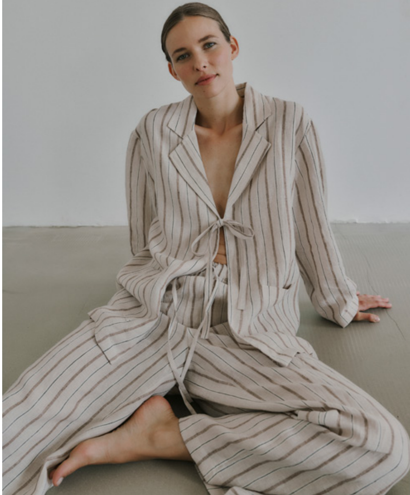
Lucia LS Jacket – C25SS0042 Lucia Pant – C25SS0043