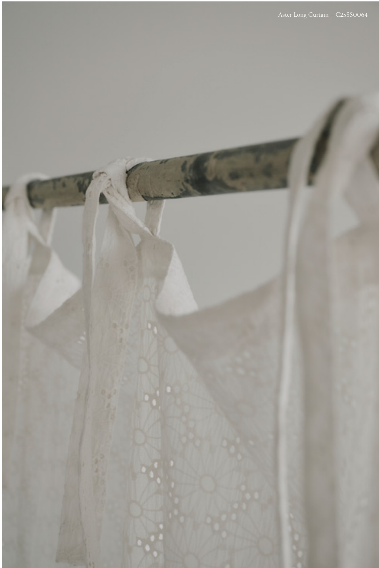
Aster Long Curtain – C25SS0064