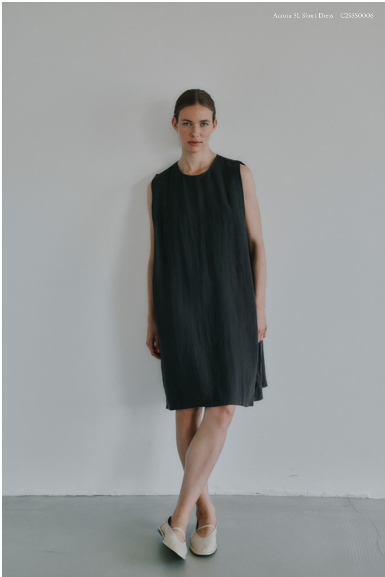
Aurora SL Short Dress – C25SS0006