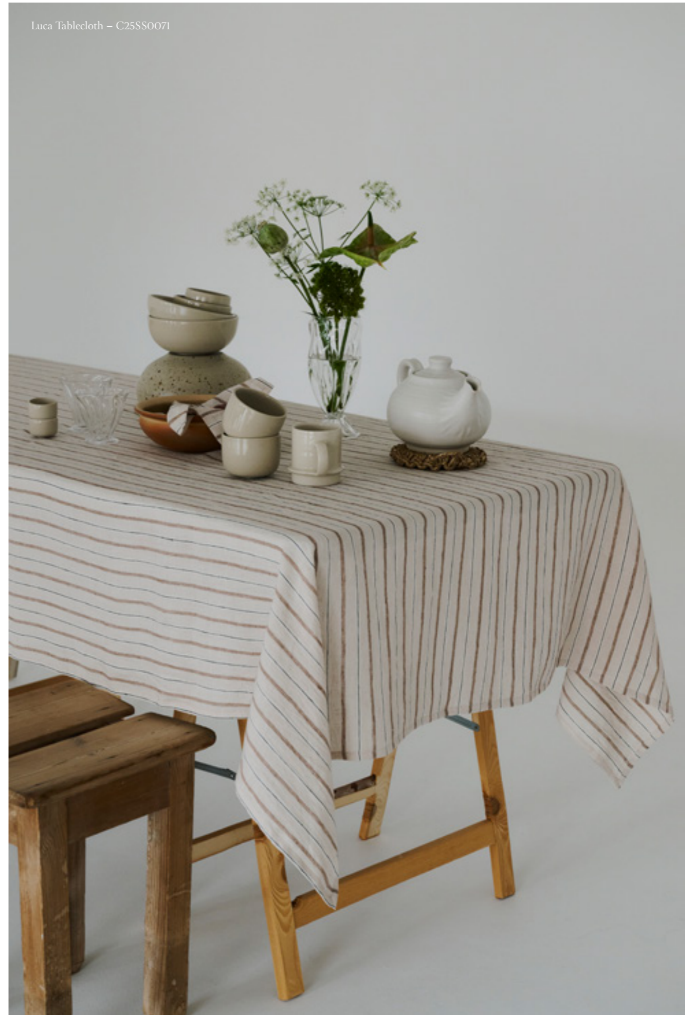
Luca Tablecloth - C25SS0071