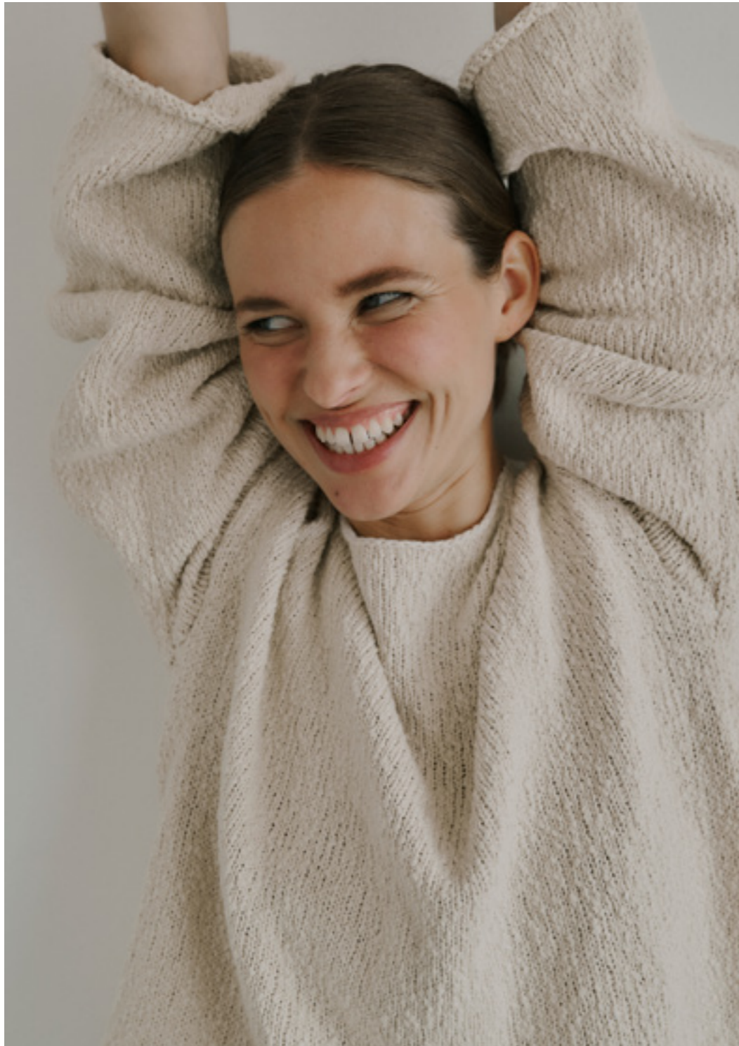
Ambra Knit Pullover – C25SS0057