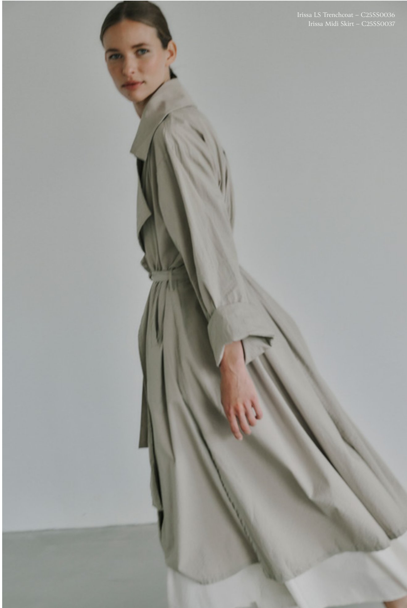
Irissa LS Trenchcoat – C25SS0036 Irissa Midi Skirt – C25SS0037