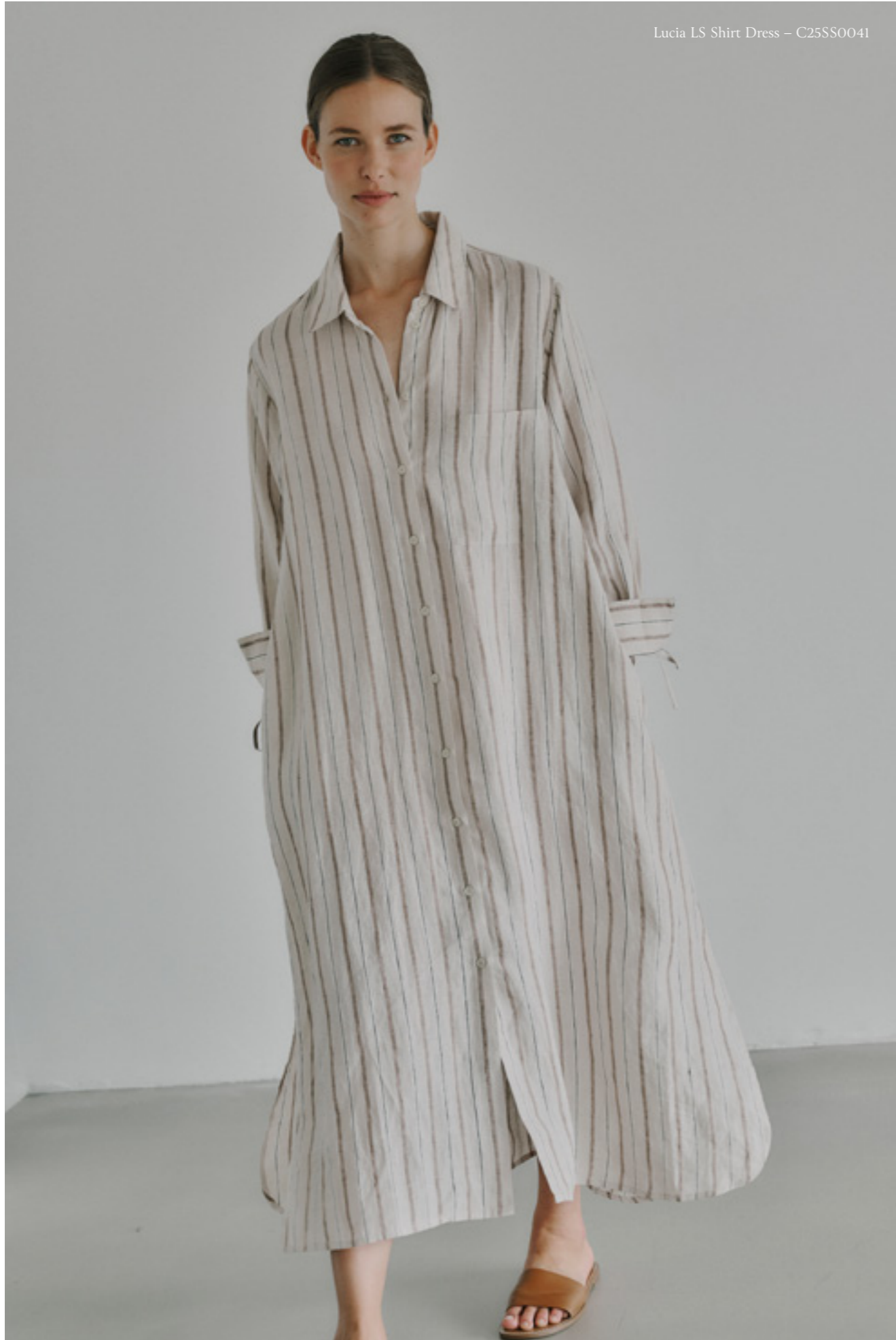
Lucia LS Shirt Dress – C25SS0041