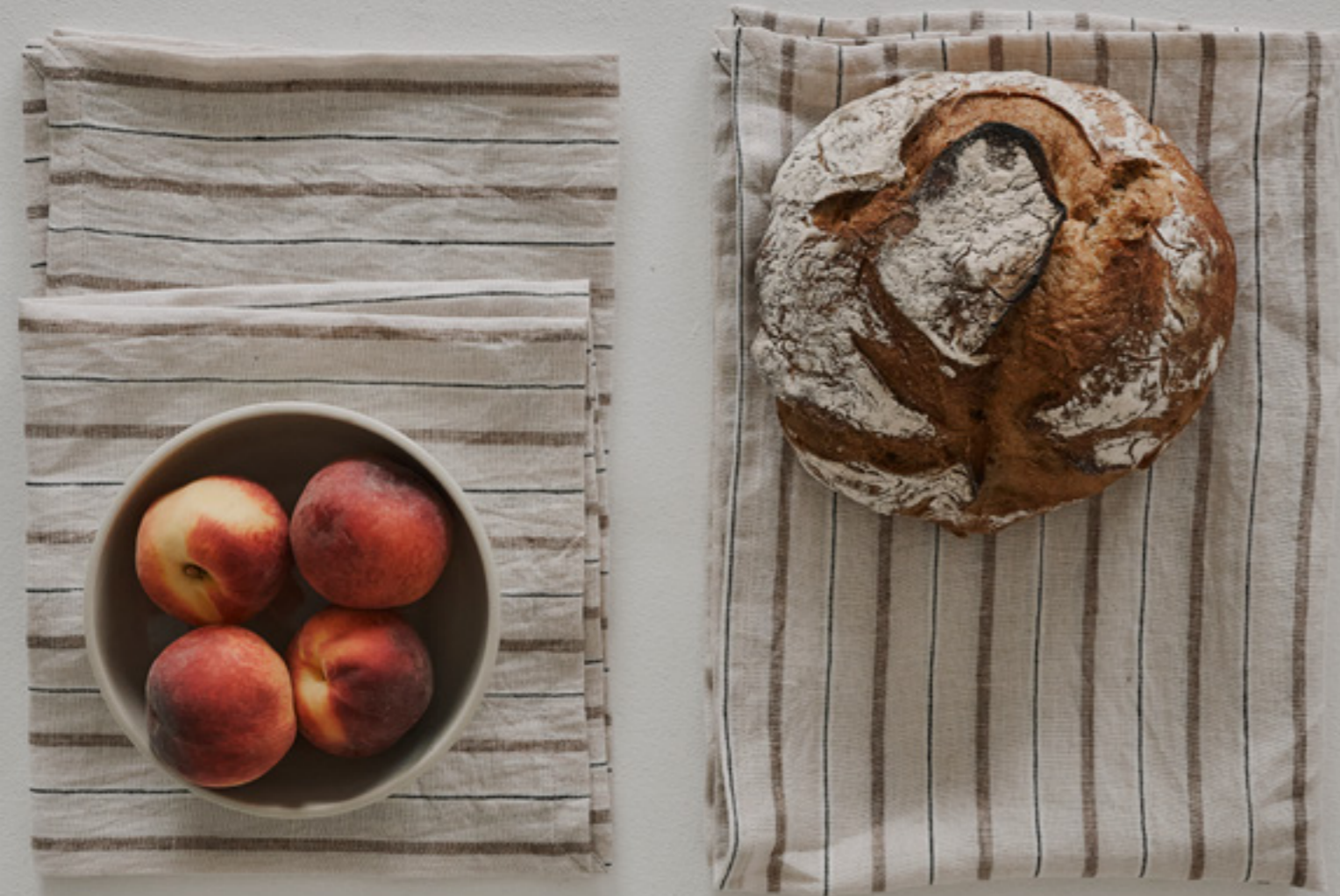
Luca Napkin – C25SS0075 Luca Tea Towel – C25SS0084