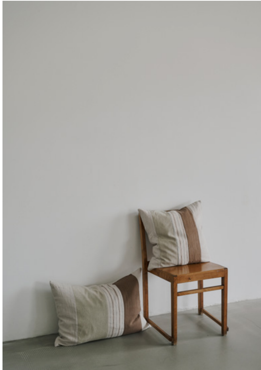
Hola Patch Cushion 50x50 cm – C25SS0082 Hola Patch Cushion 50x70 cm – C25SS0083