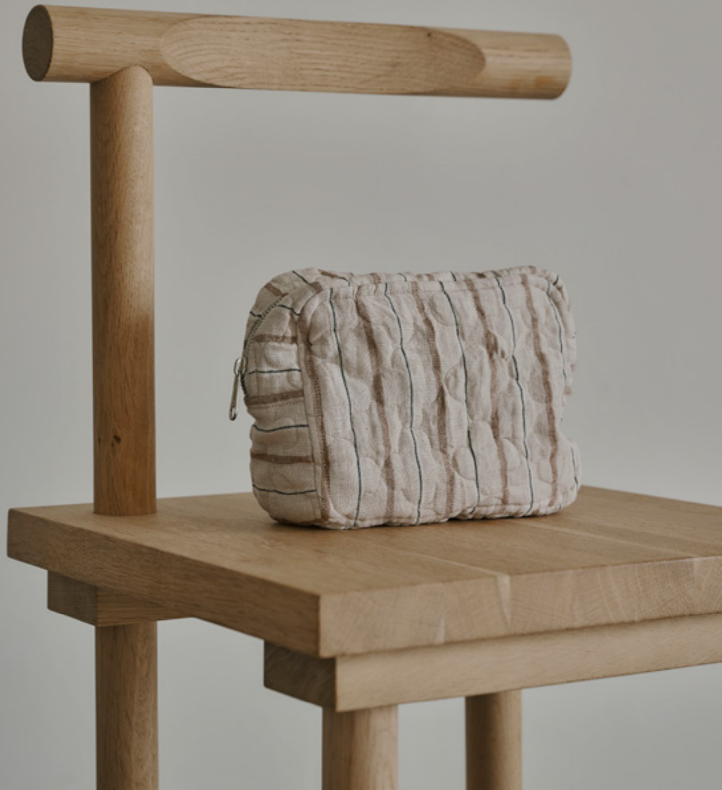
Luca Makeup Bag – C25SS0076