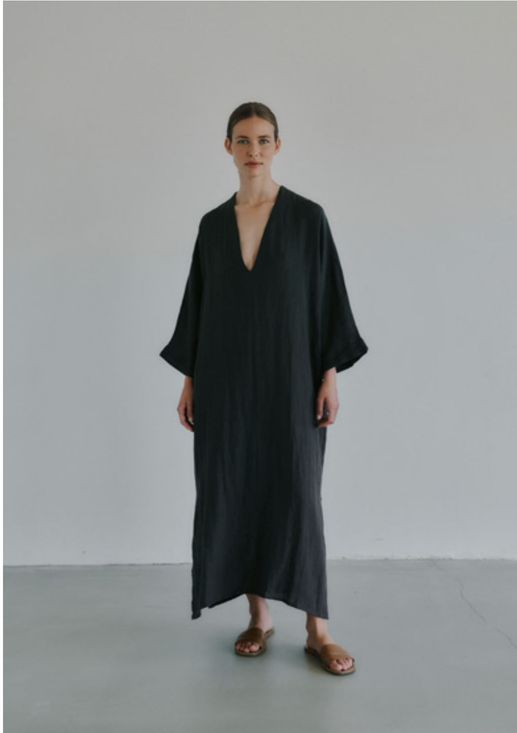
Venizia 7/8 Dress – C25SS0053