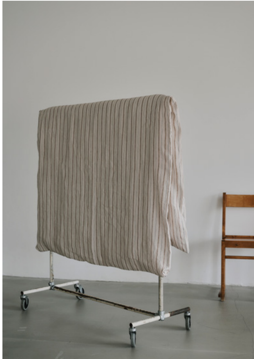
Luca Bedlinen Set – C25SS0070