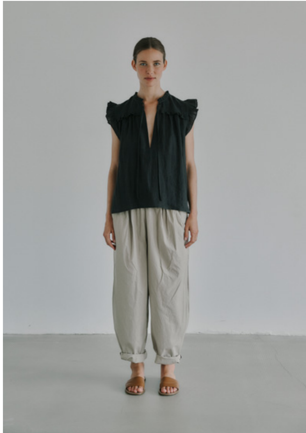
Lucia Frill Top – C25SS0046 Irissa Pant – C25SS0040