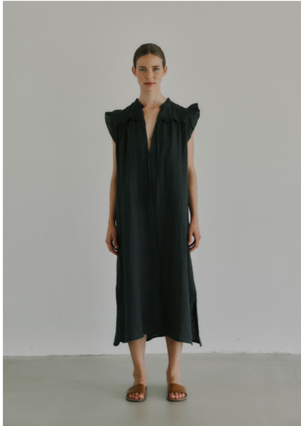
Lucia Frill Dress – C25SS0048