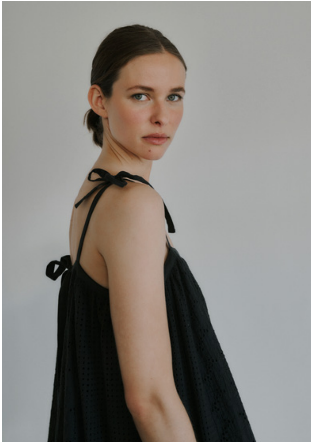
Emanuela SL Long Dress – C25SS0022