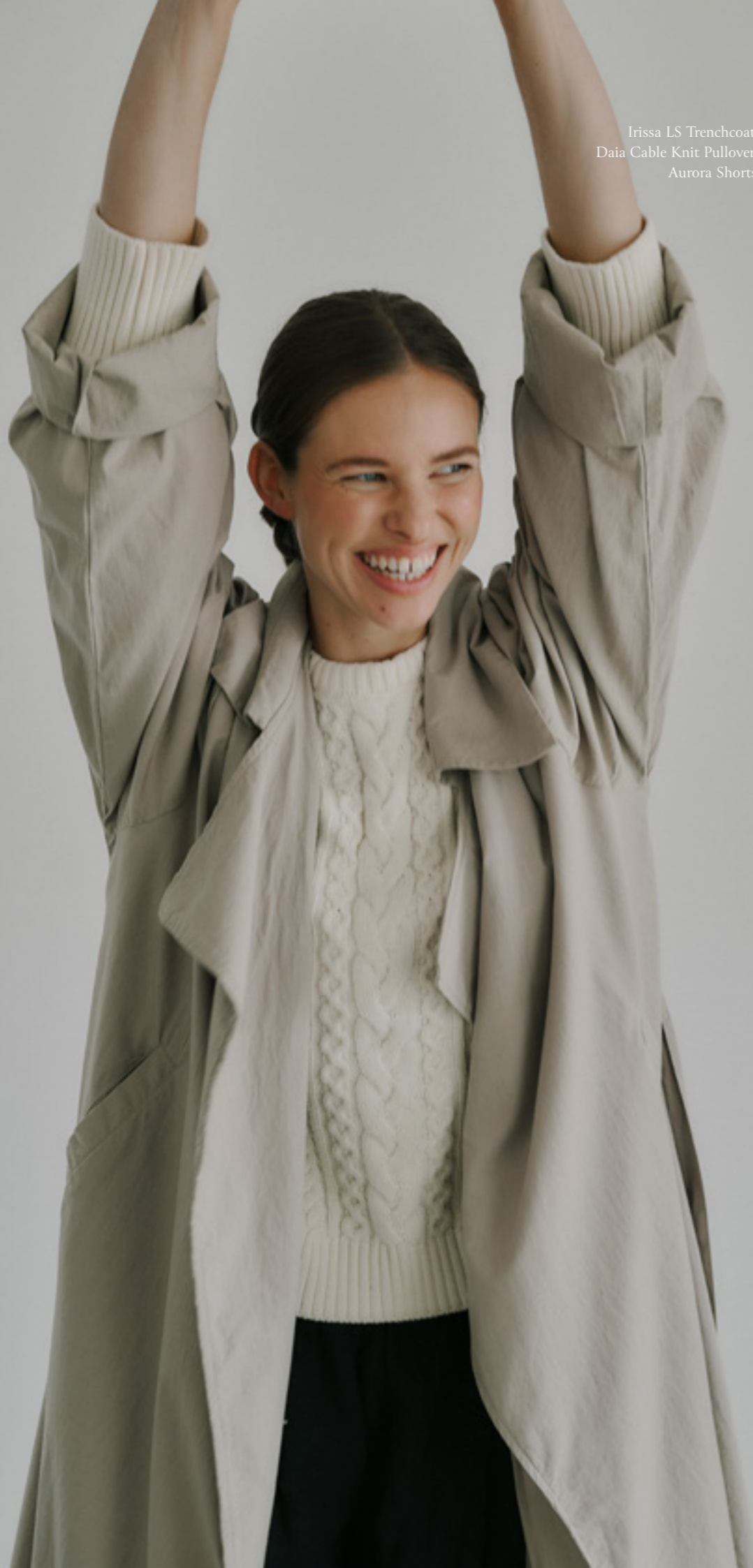
Irissa LS Trenchcoat – C25SS0036 Daia Cable Knit Pullover – C25SS0054 Aurora Shorts – C25SS0014